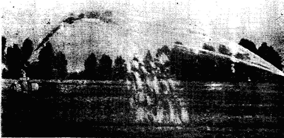
Fig. 3. Demonstrations of the micro irrigation regime with the use of IDAH in conditions of irrigation of sugar beet, maize for power and soya in the Terter AIS of the Institute of "Agriculture".

Soaking of the soil during watering did not exceed 30-60 cm. Greater wetting and better uniform moisture distribution under these conditions is achieved with irrigation rates of more than 300-400 m 3 / ha. At such rates about 60-70% of water remains in the upper (20 cm) layer, and the plants are not completely supplied with moisture. A big drawback with the irrigation of the Idad apparatus in the presence of an irrigation network, impassable for machining mechanisms. It was found out that sprinklers and roads along them occupy 6-8% of the area; For example, in this case, water losses in irrigation systems built in the Guba RRCN were 30-35% per 1 km, and in Terter AOS 20-25%. The conditions for micro adjustment of IDAID vehicles on the territory of the Guba RUCN during irrigation of orchards, on the territory of the AIA of the Agricultural Research Institute in Terter district, Sarydzhaly sugar beet and soybeans, in the Ganja RUCN in the village. B / Bagmanly orchards and vineyards.