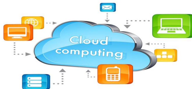
Fig (1) the general concept of cloud computing [3].

Add to that The cloud computing, enables intelligent transportation systems to solve the problem of severe traffic congestion, so that the growth in the automotive sector provides more jobs in the supply chain, the intelligent transportation systems may already provide new people and new comers to the cities [4]. The development and spread of information technology at this time helped in the presence of cloud computing rapidly became all public and private companies and educational institutions in Europe are using cloud computing in all the fields of process. Although the beginning of the spread of cloud computing in the European