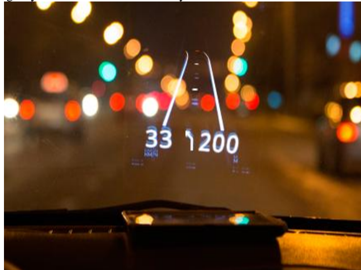
Fig. 4 HUD indicating distance to the next turn

Many times in actual driving conditions we get confused about where exactly to turn the car for reaching destination we want. As shown in fig 4 the HUD indicates the actual distance after which car is to be turned [3]. The map moves to show your progress along the route. If you move, rotate, tilt, or zoom the map, you can see your progress. When you approach an intersection or exit with multiple lanes, Navigation can help. Quickly see the estimated time remaining of your route on the bottom of your screen.