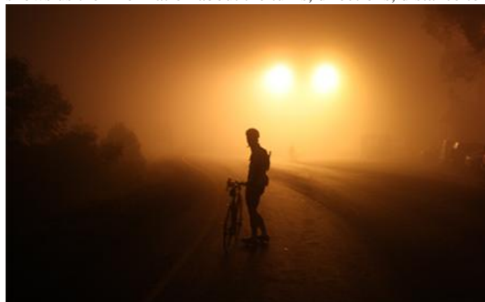
Fig. 2 driving at night without HUD

Driving at night is difficult task for every driver because of limited information about the road, directions and conditions [2]. Fig 2 shows an example of night driving condition without HUDs and shows the benefit of the HUDs. In fig 3 the HUD shows us the information about the turns, directions, distance to travel, curves etc.