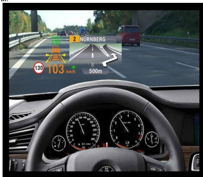
Fig. 5 Navigation

Fig. 5 shows the turn by turn navigation features of modern HUDs are so good they've almost entirely replaced standalone GPS units. But in actual use, many drivers take their eyes off the road to check the map, which can be extremely unsafe. Even if you have a car mount to keep your phone in your field of vision, using it for navigation can still result in diverting your attention from the road, however briefly[4]. The built-in navigation systems in many cars have the same problem. The distance and direction of the next turn, your current speed and the road's speed limit. It also shows whether you're near any of the speed cameras in the company's database and your estimated time of arrival.