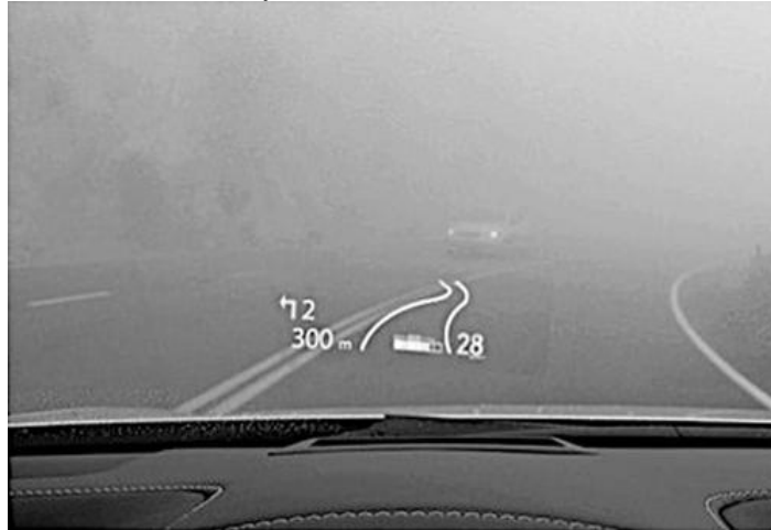
Fig. 1 HUD in low visibility environment

of the HUDs we get the required information on the screen itself. The information provided by the HUD seems to be sufficient for driving the car in low visibility areas also.