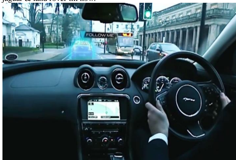
Fig. 7 Ghost car navigation

Most modern navigation systems instruct drivers using a series of arrows or at best a pictographic representation of a highway exit. However, Jaguar's new experimental system abandons the arrows and instead projects an image of a "Ghost Car" for the driver to follow. Officially known as "Follow-Me Ghost Car Navigation," the system uses the heads-up-display technology to project an illuminated "ghost car" that looks to be driving right in front of the actual vehicle as shown in fig 7, "Driving on city streets can be a stressful experience, but imagine being able to drive across town without having look at road signs, or be distracted trying to locate a parking space as you drive by," said Jaguar Land Rover's director of research and technology, Dr. Wolfgang Epple, in a statement. This technology is used in jaguar & land rover till now.