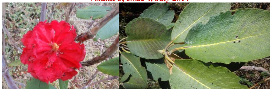
Fig. 2 Rhododendron arboreum recorded in Barsey, West Sikkim.